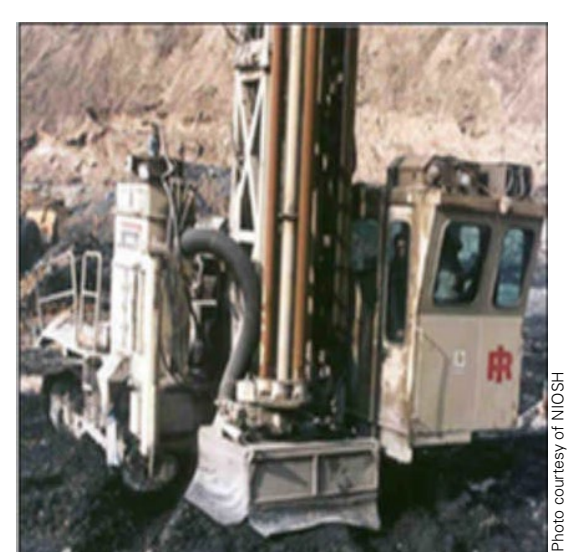
Vehicle-mounted drilling rigs with dust collection system around drill bit and low-flow water spray to wet the dust discharged from the dust collector. The enclosed operator's cab is on the right. The dust collection system is on the left.

In wet drilling systems that use forced air (bailing air) to flush cuttings from the hole, water is added to the bailing air at the drill head. Small particles join to form larger particles, thus reducing escaping respirable dust. The proper use of wet